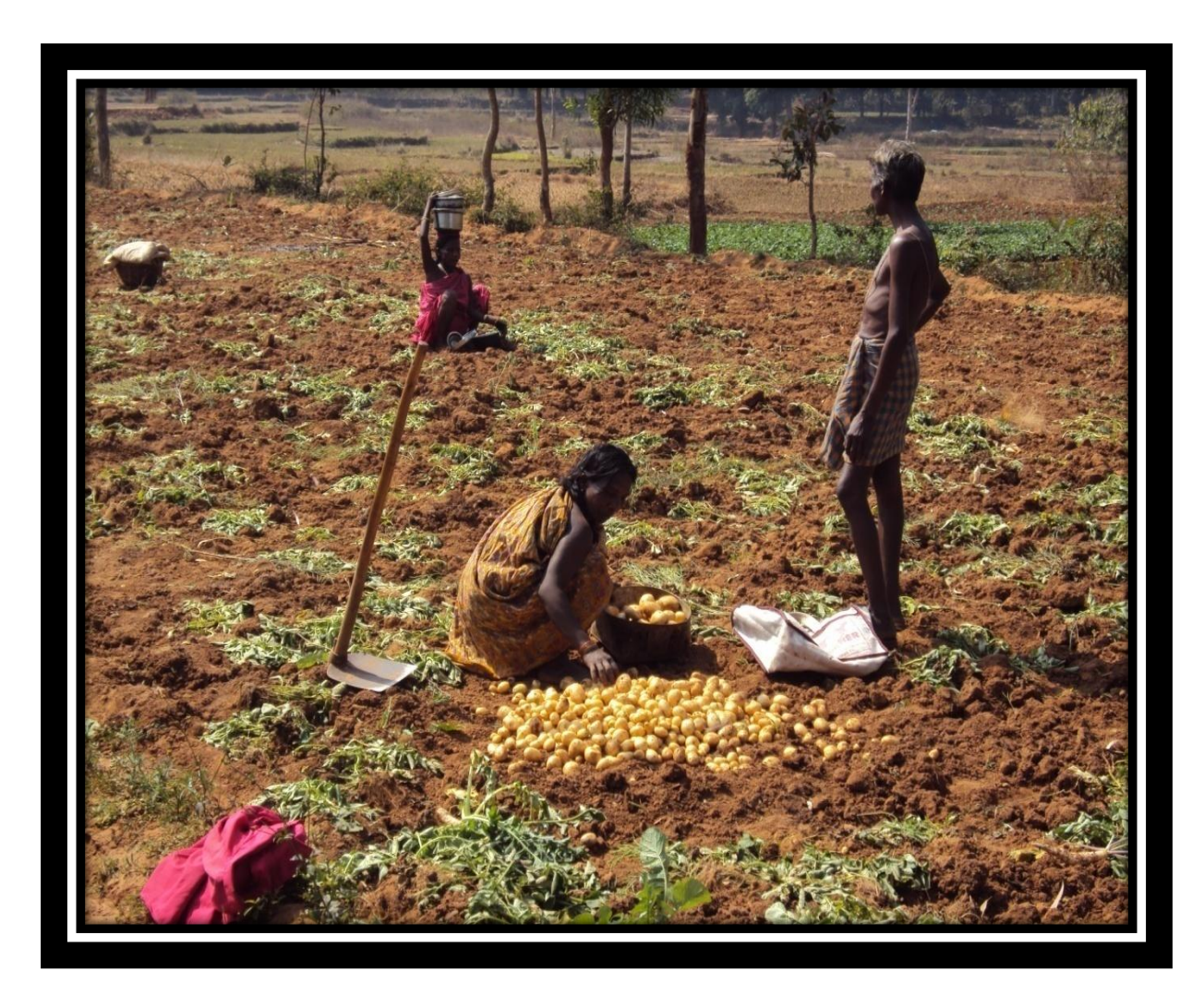
WORD: Women's Organization for Rural Development Hatopotha, Mathalput, 763008, Koraput District, Odisha, India